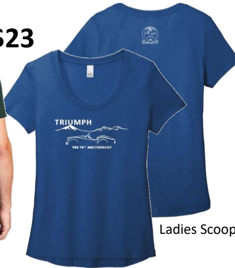
Ladies Scoop Neck