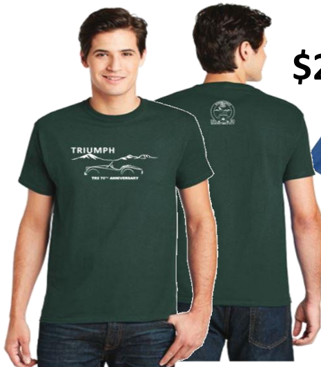
Men's Crew Neck

REGALIA ORDERS NOT AVAILABLE AFTER JUNE 30TH