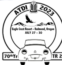
T-SHIRT BACK TOP